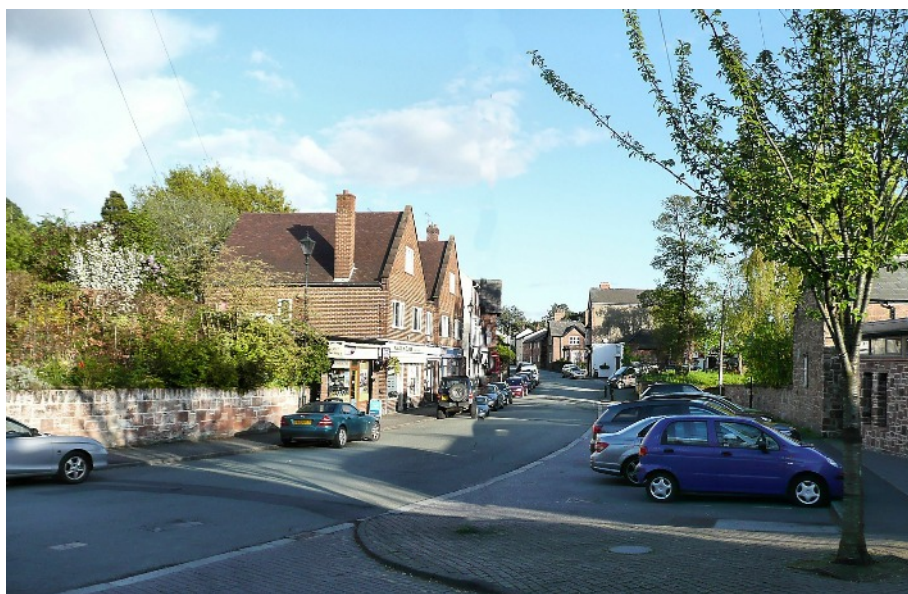
Heswall Conservation Area - centre of Heswall

The LDF makes reference to a 'Heritage Local Plan' but as yet nothing has been published other than a commitment to prepare such a plan. Conservation areas and other heritage assets are referred to in the proposed specific settlement area policies but there is no overriding policy. A meeting will be requested with Andrew Fraser of Forward Planning to clarify this issue.